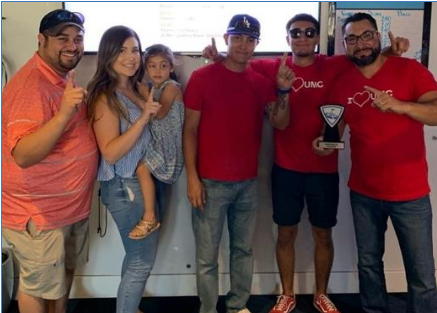
They came to play and they walked away with first place in the Top Golf tournament.

As for Top Golf, plans are already in the works for Top Golf 2020!