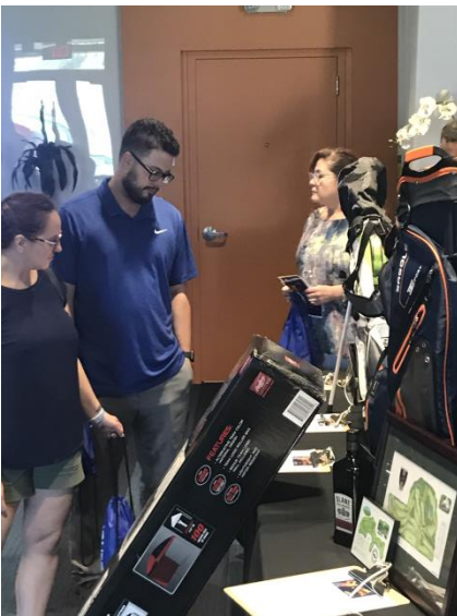
The silent auction was a huge success as virtually all items were auctioned.