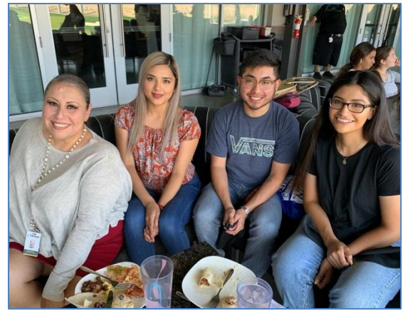
Family and friends enjoy a delicious breakfast.

The event featured a great breakfast buffet, beverages, desserts, and a great bag of swag goodies for each participant. Many Associates