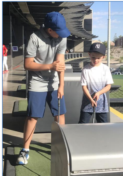
There's nothing quite like getting your first golf swing lesson from your older brother.