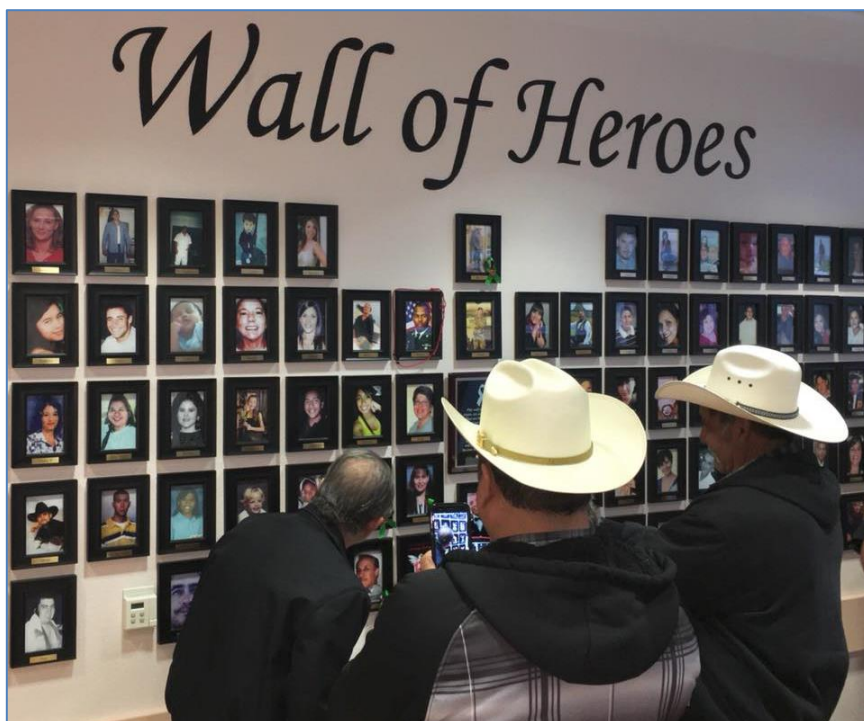
Families visit images of their loved ones and others on UMC's Wall of Heroes during Friday's ceremony.

hospitals in our nation and in our city that have similar walls and recognition centers for those who saved lives through organ donation.