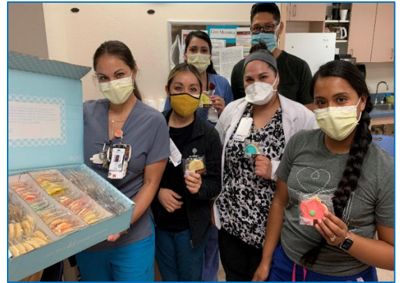
UMC's ICU Staff Poses with the Cookie Donation

Thank you ICU staff for your constant care for our patients! UMC continues to receive many donations from people and organizations who are grateful for the service and compassion our Team UMC provides.