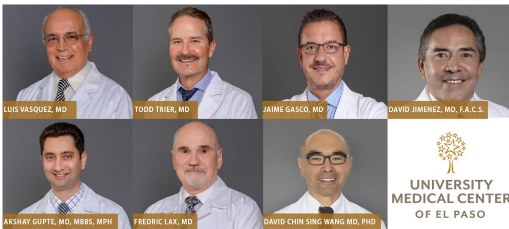
UMC's team of neurosurgeons, above, comprise the largest, most experienced neurosurgery team in the region. No other hospital or organization in our region has the depth and range of specialty and surgical care as provided by UMC's neurosurgeons.