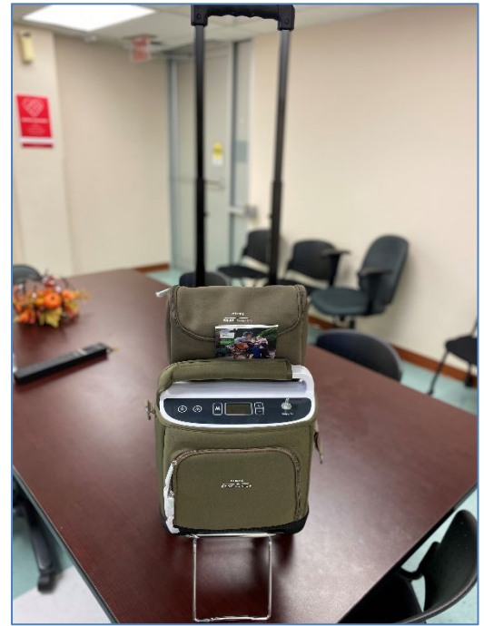
Portable Respirator Concentrator

Portable concentrators are a cost-effective option that permits physicians to discharge eligible patients sooner, therefore, shortening the hospital length of stay (LOS). UMC is placing renewed emphasis on early discharges by identifying ready-to-go patients the day before using patient-tracking technology.