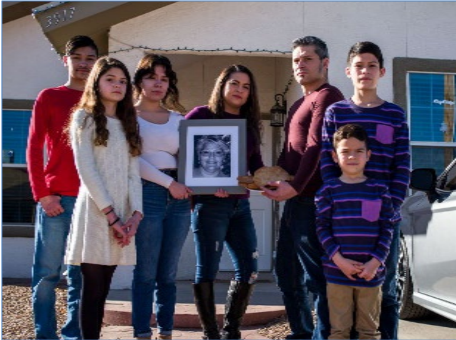
The Martinez Family Gathers For A Picture Remembering The Loss Of Their Grandmother

However, it is tremendously important to emphasize that the COVID-19 vaccine must be treated as one piece of the puzzle to defeat this virus once and for all. We must not let our guard down not even for one brief moment until we can finally declare victory over this invisible enemy.