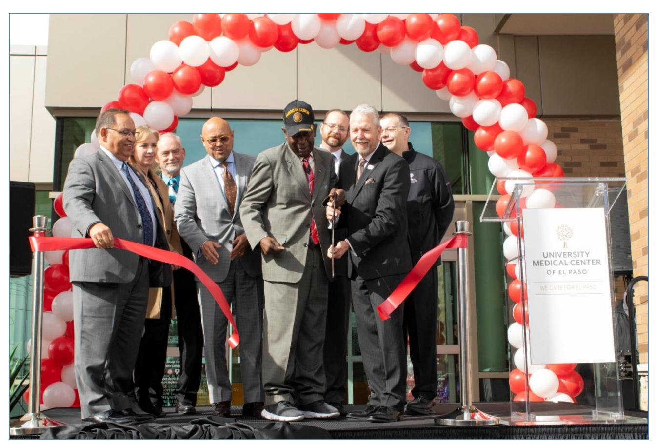
County, UMC Welcome New Northeast Emergency Department

University Medical Center of El Paso and El Paso County leadership Tuesday cut the ribbon on a brand new, state of the art emergency department in Northeast El Paso. The new center features more rooms, faster care, than virtually any community emergency center in El Paso.